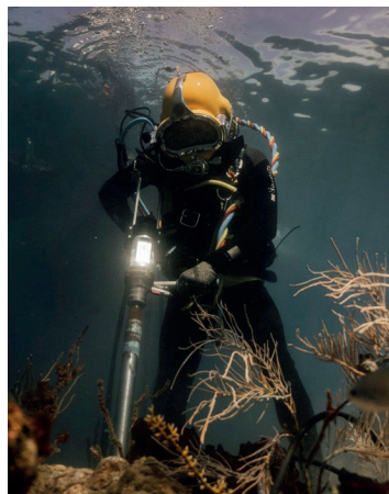
AK46 installed on drill rig