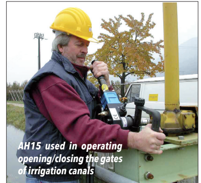
AH15 used in operating opening/closing the gates of irrigation canals

AH15 is a tool designed for the rotation in the two senses of pipe drilling machines for hot tapping connections operations normally necessary in the maintenance of gas and water networks. For its exclusive characteristics AH15 can be used also for the rotation of other rotary devices like: gates irrigation canals, lifting/lowering of rail road devices, rotation of reducers, ecc. The tool features a “twist type” control handle to turn clock wise and counter clock wise, ON/OFF control is proportional so can increase or reduce speed in both rotations modes, the torque force and the rotation speed can be adjusted by acting on the two valve that control these functions. The handle with spring return assures total safety, the rotation immediately stops when the operator releases the handle (“dead man” action) AH15 eliminates the fatigue and increases the productivity.